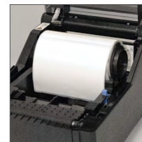
Drop-Load-Go Media Bin