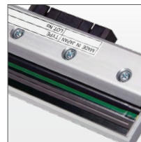
Easy Print Head Replacement